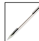
20mm sample notch