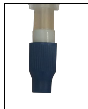
Twist Valve cock Not available in UK

Manufactured by Adria srl Via Modena, 46 40017 San Giovanni in Persiceto (BO) Italy Tel: +39 0376 559 772